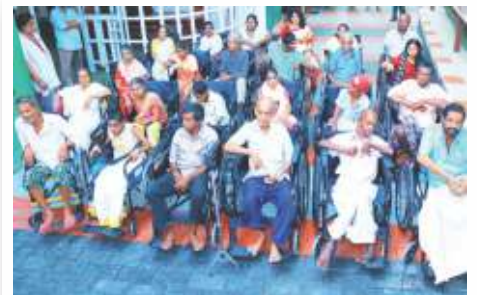
A partial view of Disabled Inmates