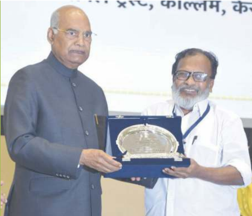
RECEIVING VAYOSHRESHTHA SAMMAN 2019 FROM THE HONORABLE PRESIDENT SHRI. RAMNATH KOVIND