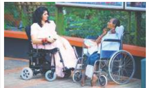
Netaji Block and Sabarmathi Village for Physically Handicapped